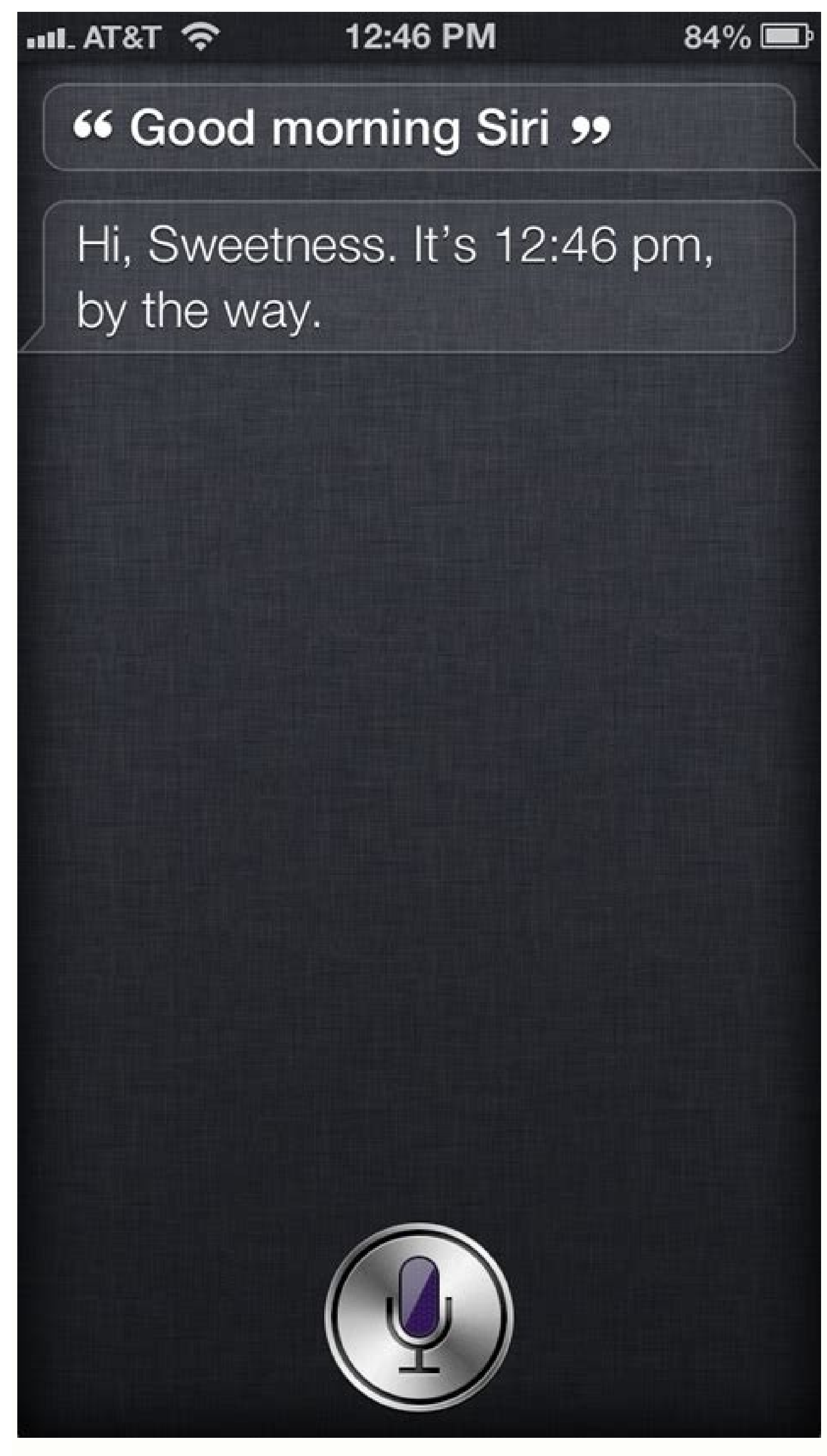
Can android use siri. Do androids have something like siri. Do android phones have something like siri. What does android have instead of siri. Iphones have siri what do androids have. Does android have something like siri. Does an android have siri.

There is no doubt that Apple makes some of the best software in the world. Their operating systems run like well oiled, optimized machines. There is no wonder that many people want to have Siri like apps for Android as well. Still... For those who are uninitiated, Siri is Apple's voice assistant and has gained a lot of popularity among iPhone users. Having used an iPhone myself, I have to say, Siri is unquestionably one of the biggest highlights of the OS. Related: 4 Best Personal Assistant Apps for Android - Take Hands Free Control But how about Android phones? This article aims to gather the best Siri-like apps for Android in one place so you can get your personal voice assistant as well. However, after testing around 10 such apps, we have sadly come to the conclusion that Siri is still the undisputed king (or queen) of mobile voice assistants. But, that certainly does not mean that we don't have good alternatives for Siri available on